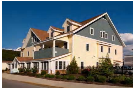
Covenant House is dedicated to working for justice by offering direct services for people in need while creating social change through education.

bring to the Spring Conference, we'll be glad to see that they find their way into the right hands!